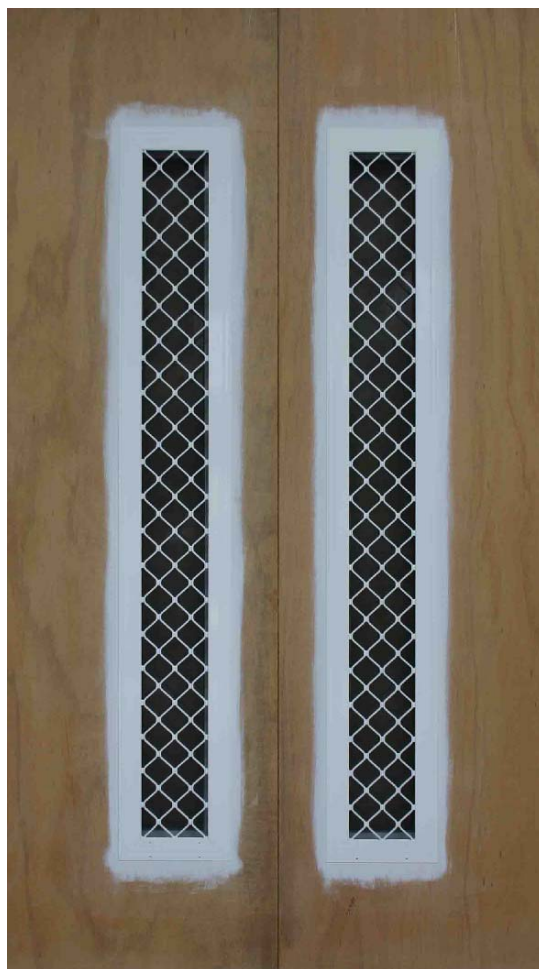
Paint grade rebated pair of very narrow (585mm each) CombiDoors with powdercoated white small diamond security alloy grills – before final painting and installation.

If you have any questions feel free to contact us.