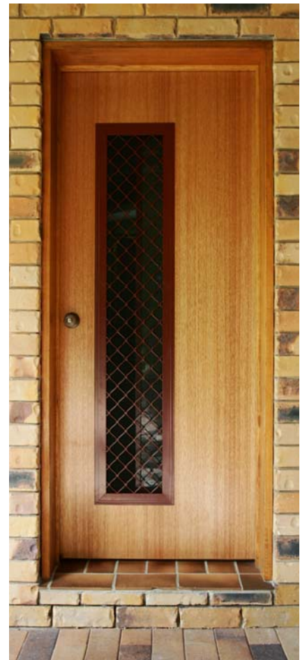
A timber finished CombiDoor with small diamond alloy security grill, powdercoated Manor Red.