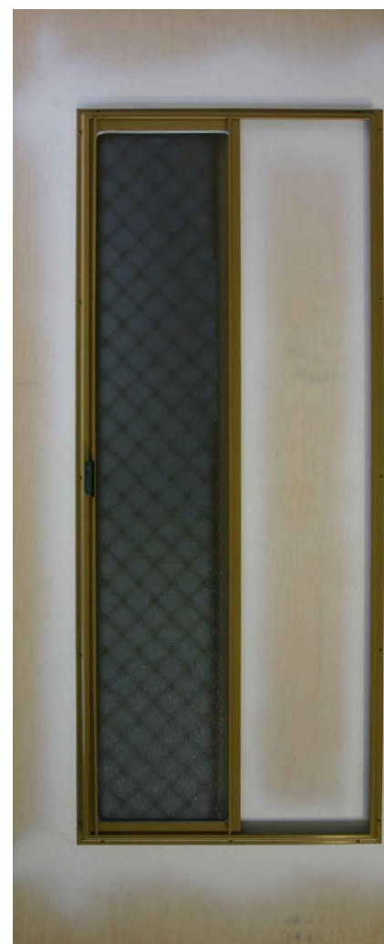
Front view (left) and rear view (right) of a paint grade CombiDoor with gold powdercoated small diamond alloy security grill showing under-painting extending slightly beyond the alloy – before final painting and installation.

* ColourBond is a registered name of Bluescope Steel.