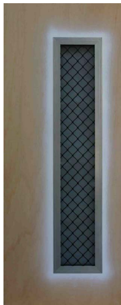
Paint grade CombiDoor (before final painting and installation) powdercoated grey with a black small diamond alloy security grill. This photo also shows basic under-painting extending a little beyond the alloy to allow completion of painting by painting up to the alloy.

Pairs of CombiDoors , or combinations of door sizes can also be supplied. These can be manufactured with the lock edge rebated or flush.