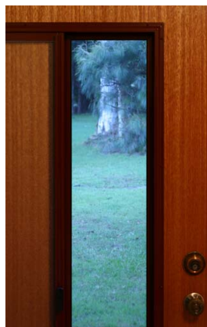
Looking out through a CombiDoor , from the inside, with stainless steel security mesh.

Five sizes of stainless steel mesh opening panels are available in the same sizes as supplied in CombiDoors with the alloy grills.