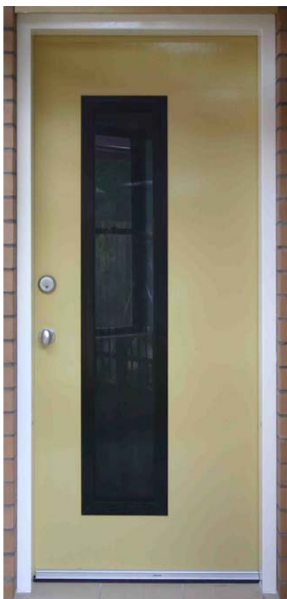
Painted CombiDoor with black stainless steel security mesh and black powdercoated alloy.