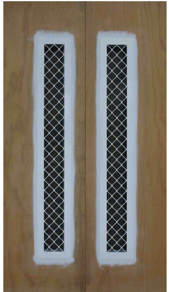
Paint grade rebated pair of very narrow (585mm each) CombiDoors with powdercoated white small diamond security alloy grills – before final painting and installation.

If you have any questions feel free to contact us.