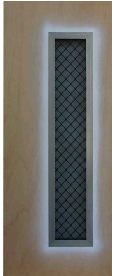
Paint grade CombiDoor (before final painting and installation) powdercoated grey with a black small diamond alloy security grill. This photo also shows basic under-painting extending a little beyond the alloy to allow completion of painting by painting up to the alloy.

Pairs of CombiDoors , or combinations of door sizes can also be supplied. These can be manufactured with the lock edge rebated or flush.