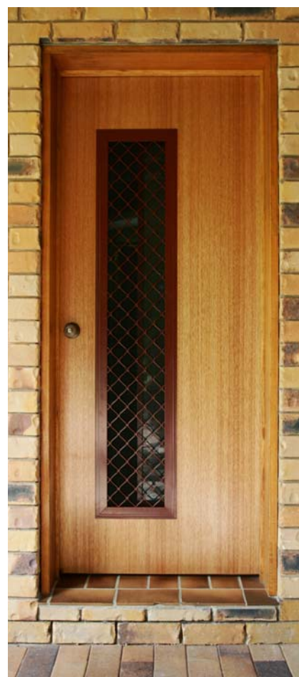
A timber finished CombiDoor with small diamond alloy security grill, powdercoated Manor Red.