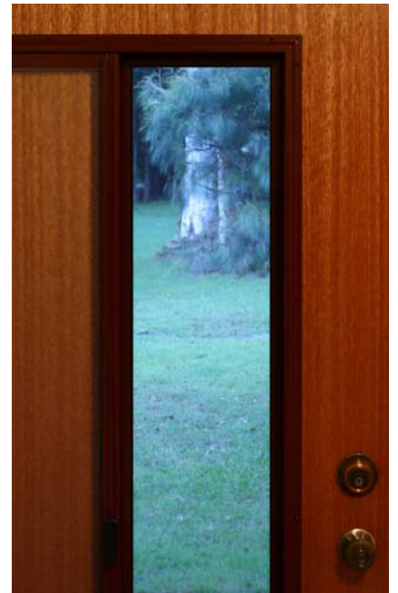
Looking out through a CombiDoor , from the inside, with stainless steel security mesh.

Five sizes of stainless steel mesh opening panels are available in the same sizes as supplied in CombiDoors with the alloy grills.